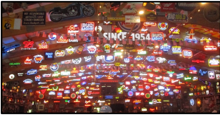
Left: Sensory overload at our second stop!