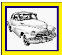
1948 Chevrolet Fleetmaster