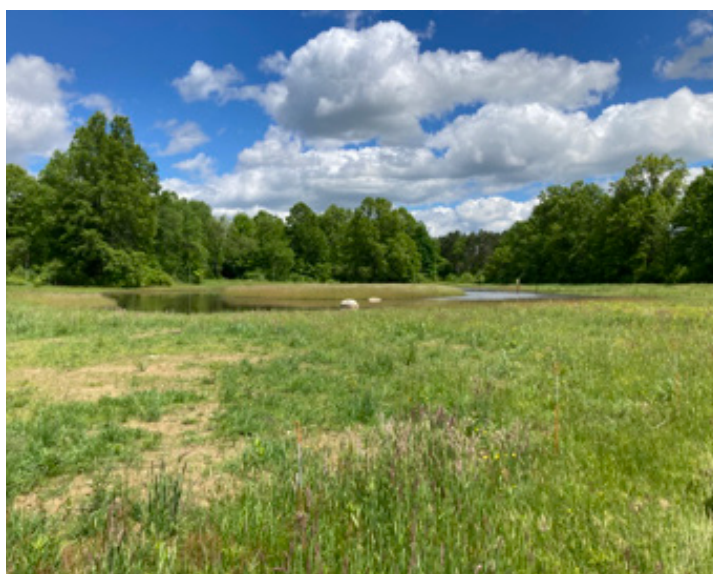
The New Wetland