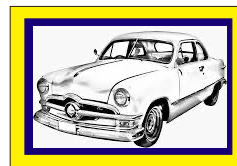
1950 Ford Custom