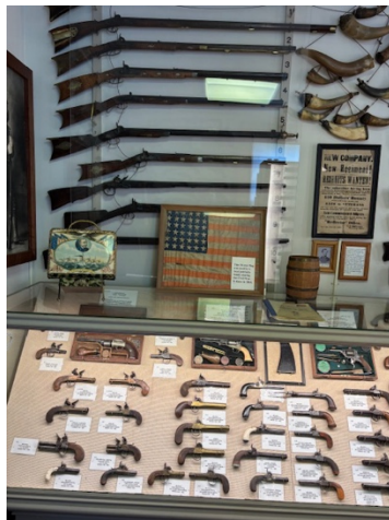
Part of the historical society's weapons collection

Our tour then took us to the Firelands Historical Society which has an interesting and impressive collection of artifacts. Their tour guides were very knowledgeable and gave us great information about the history of the Firelands area of northern Ohio. Then it was on to a delicious and relaxing lunch at the Elks in downtown Norwalk.