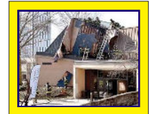
Fire, Smoke, Water Damage