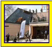
Fire Damage to Planetarium's Roof