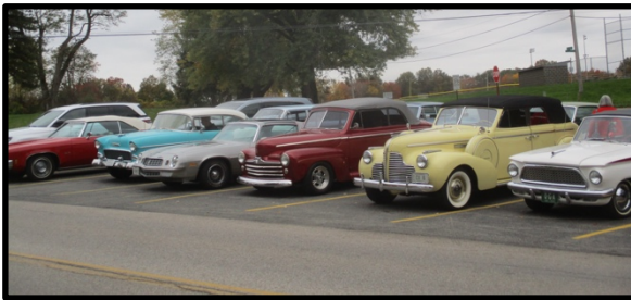
Cars lined up at the model train museum