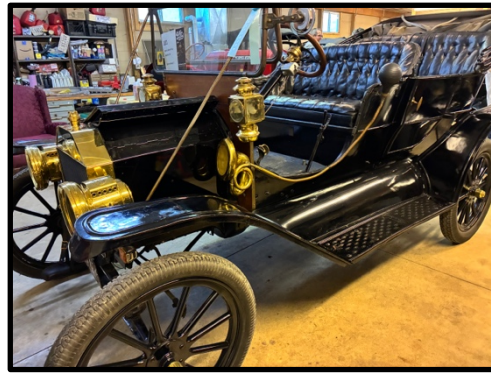
Beautifully restored auto seen on the tour