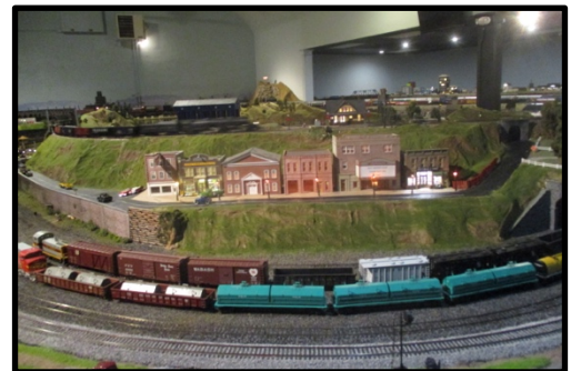
Model train museum - circus layout on the left, town on the right