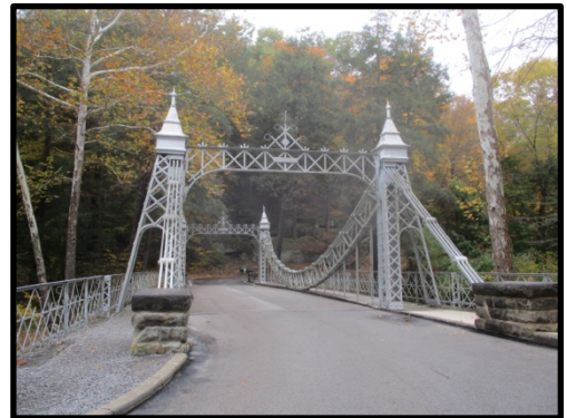
The Cinderella bridge, one of many on the tour