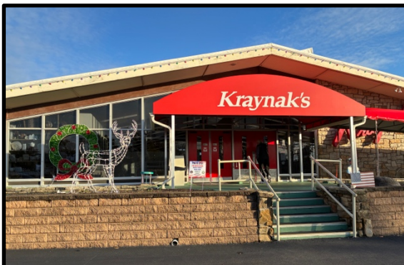
Kraynak's Floral and Gift shop, below and right