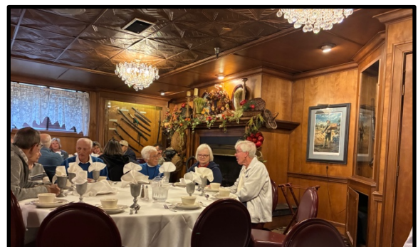
Lunch in the elegant dining room at Tara, shown left