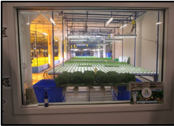
Lettuce growing at Winn Aquaponics